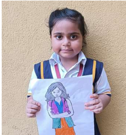
MARIYA H K2 KIWI