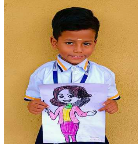
THIVITHRAN K K2 STRAWBERRY