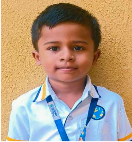
NIVESH R K2 LITCHI